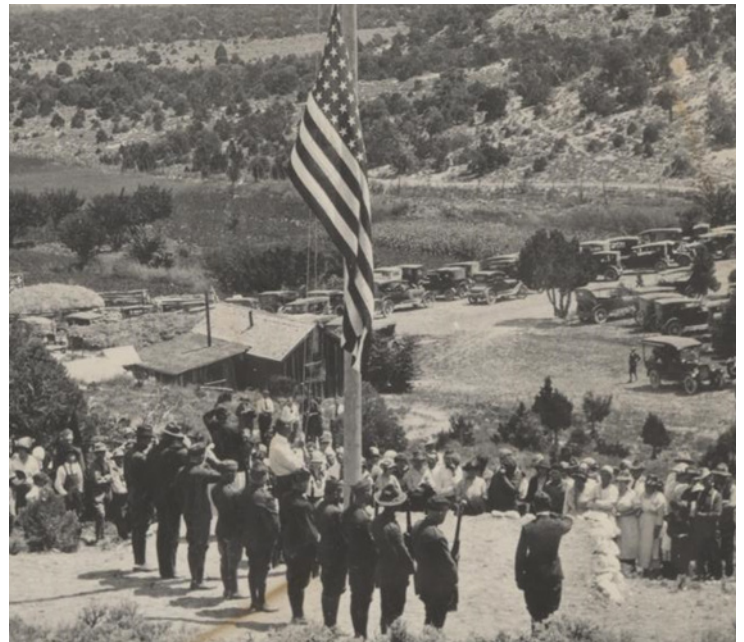
Caption: The image above depicts the ceremonial raising of the U.S. Flag for the dedication ceremony of what once was Lehman Caves National Monument.

Watch for "Highlights of History" through 2021. Join us for the special centennial celebrations in 2022, including a rededication ceremony and flag raising on August 6th, 2022.