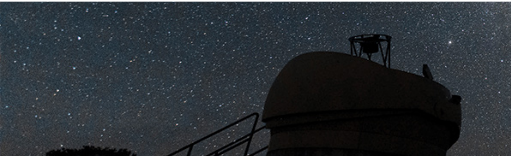
Caption: The Great Basin Observatory in the only Research-grade observatory on a National Park.

location, this new Astronomy Amphitheater promises to continue the Great Basin National Park tradition of sharing the pristine dark skies with the public. Great Basin National Park plans to start Astronomy programs in the new location in the summer of 2021. For more information about Astronomy in the park, please visit our website .