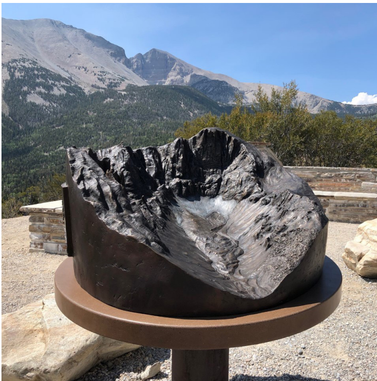
Caption: Through partnerships this new bronze map will allow visitors to "see" inside the Wheeler Peak Cirque.