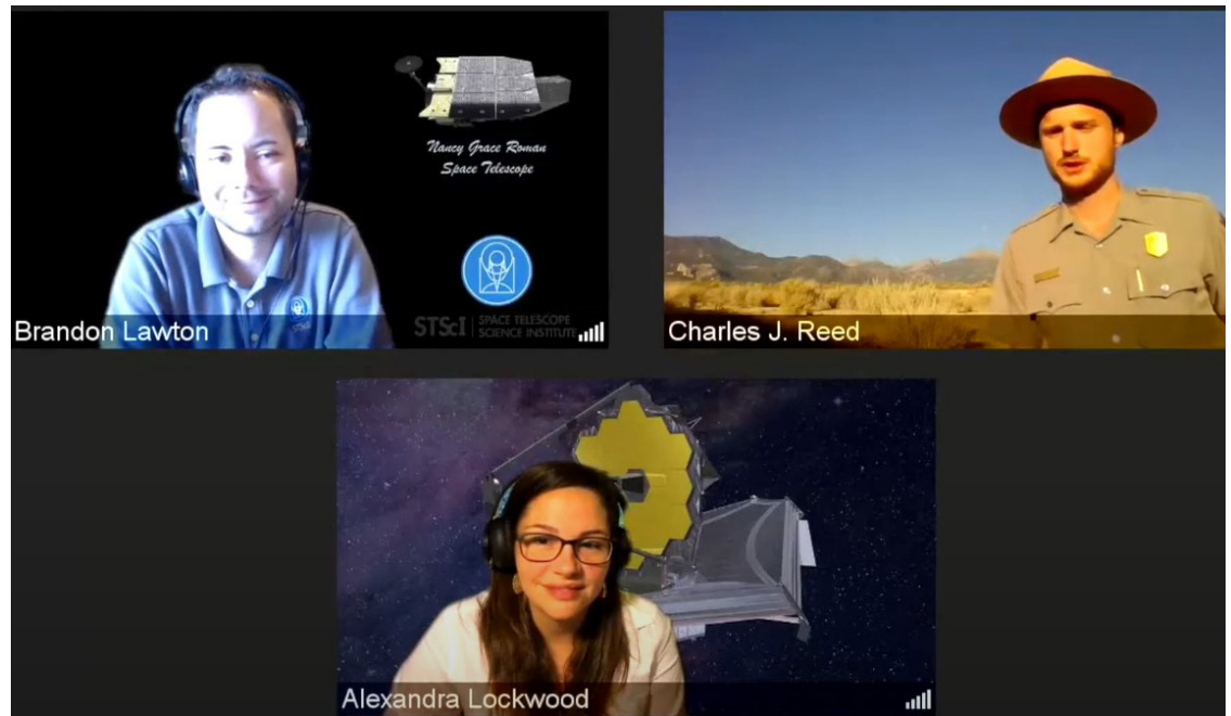
Caption: “Ask-the-Experts”, a virtual event during the Astronomy Festival where visitors were able to submit questions to experts from the Space Telescope Science Institute to be answered during the virtual festival presentation.

park’s Youtube Chanel . The goal was to inspire people to learn more about the night sky that we all share. The park was able to provide programming to over 500 visitors in the span of the three-day festival. Through partnerships with the Space Telescope Science Institute, the Great Basin Observatory, and the International Dark-Sky Association, Great Basin National Park was able to produce seven virtual programs. These virtual programs covered many exciting and interesting subjects such as how to stargaze on your own, a stargazing guide for the festival, and talks from guest speakers. We welcomed scientists from the Space Telescope Science Institute in an “Ask-the-Experts” virtual program where experts answered questions from visitors about the new James Webb and Nancy Grace Roman space telescopes. Great Basin National Park will strive to continue programming like this into the future, hoping to give visitors of all ages that “aha moment”.