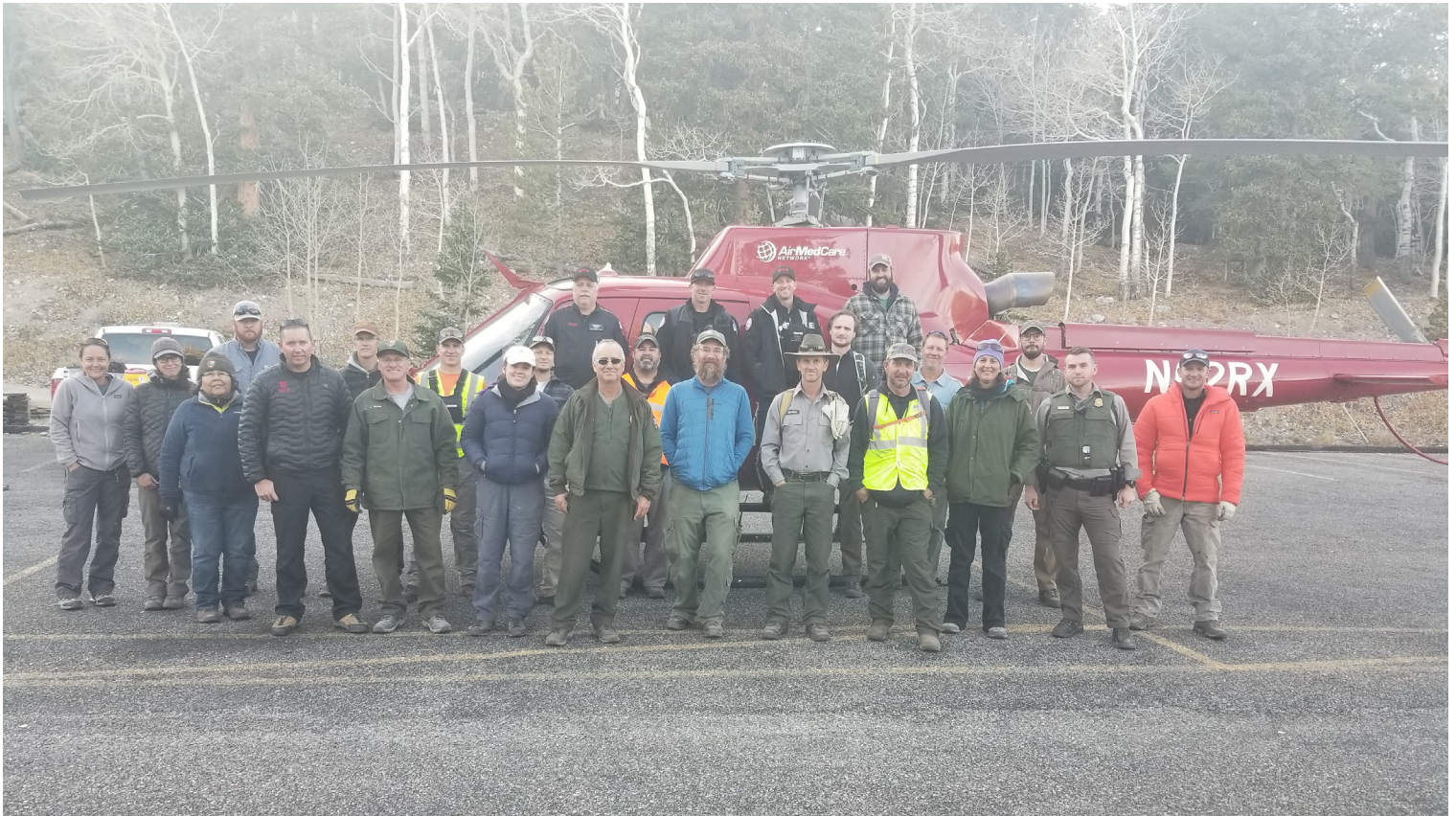
Caption: Great Basin National Park staff rely on the work of volunteers, EMT's, and White Pine County workers to maintain a reliable safety network for when accidents happen, and visitors need our help.